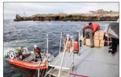
Crewmembers offload supply boxes from the deck of the M/V Dillard for researchers at the Farallon Islands.

And so it was in April when a scheduled resupply ship broke down that the